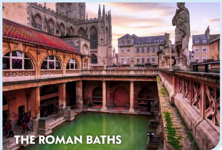
THE ROMAN BATHS